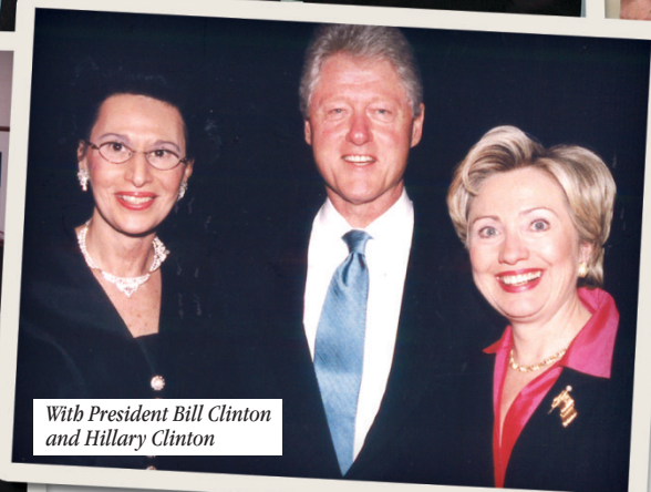
With President Bill Clinton and Hillary Clinton