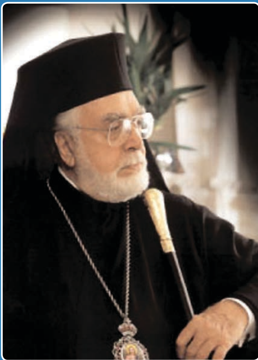
Archbishop Iakovos +