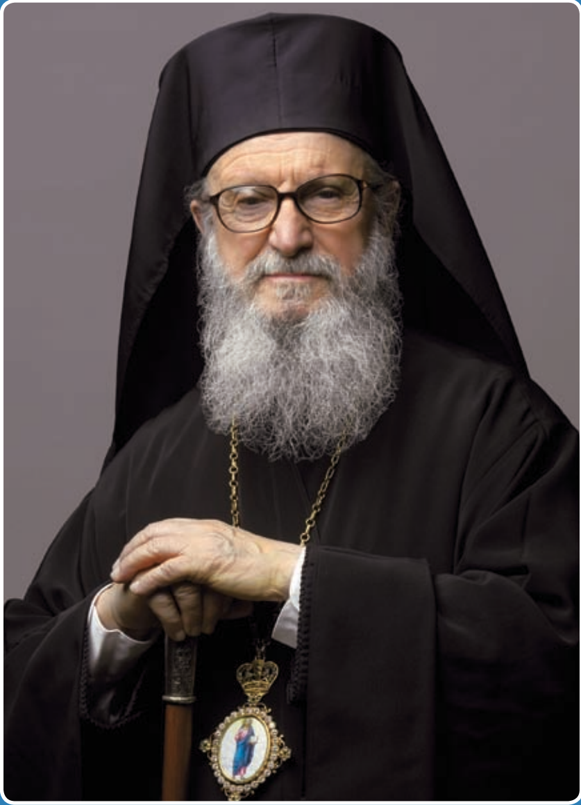
His Eminence Archbishop Demetrios of America