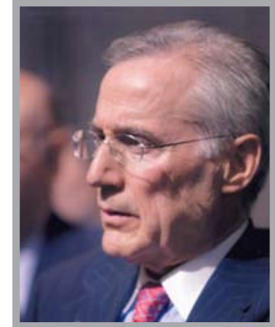
Ambassador Loucas Tsilas The Importance of Hellenism Today