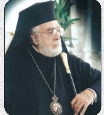
HIS EMINENCE ARCHBISHOP IAKOVOS.

Today, the Archbishop Iakovos Leadership 100 Endowment Fund, renamed in recognition of Archbishop Iakovos' vision, is a separately incorporated endowment fund supporting the National Ministries and priority needs of the Greek Orthodox Archdiocese of America, but broadly dedicated to advancing Orthodoxy and Hellenism in America.