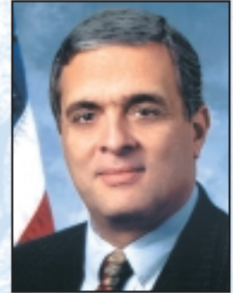
GEORGE J. TENET

The Leadership 100 Executive Committee approves grants after consultation with the Archbishop and after review of grant applications meeting its guidelines. The principal of the Endowment Fund remains permanently restricted and inviolable .