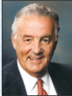
SENATOR PAUL S. SARBANES

With our 12 th Annual Conference in February of 2003, Leadership 100 is inaugurating the Leadership 100 Award for Excellence , as recognition of outstanding Greek American leaders who have excelled in their vocation and who are committed to the advancement of Hellenism in their professions and in their lives. The Award is a commemorative honor given by Leadership 100's outstanding Greek American leaders that acknowledges the recipients' achievement and gift of leadership.